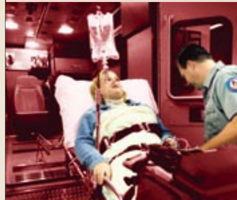
emergency medical technician - paramedic advanced