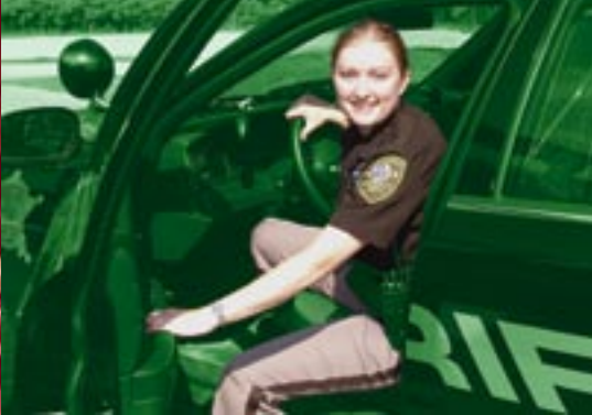
public safety officers

The 24/7 care of our residents is in the hands of technical college graduates. Fulfilling our most basic yet critical needs for safety, early education and nourishment, technical college graduates are often the first to respond to a request for help.