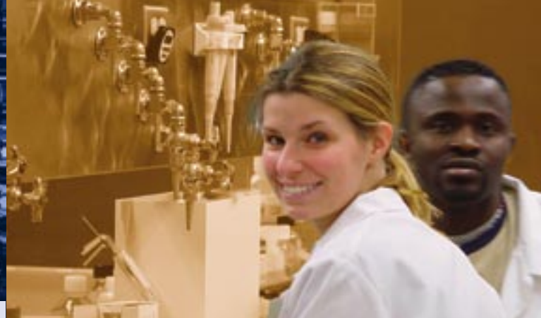
environmental and pollution control technicians

Behind all the positions needed to keep our communities productive and safe: The Wisconsin Technical College System prepares the workers for the most critical occupations.